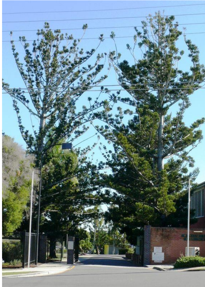
Wynnum Memorial Avenue

The Wynnum Memorial Avenue was planted in 1920 to form an avenue of honour dedicated to the memory of the men from the Wynnum district who died in service or were killed in action in World War One.