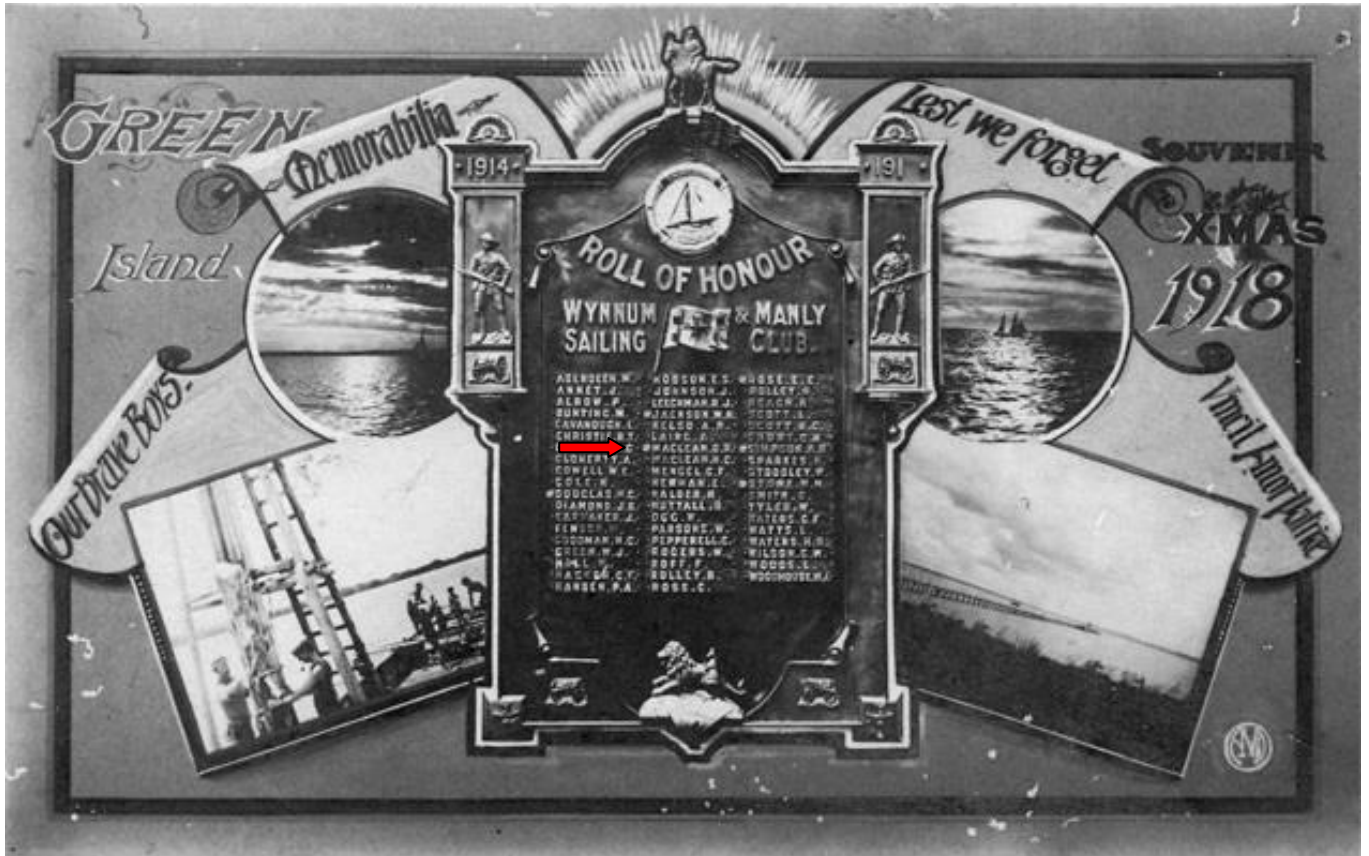
Wynnum & Manly Sailing Club Roll of Honour