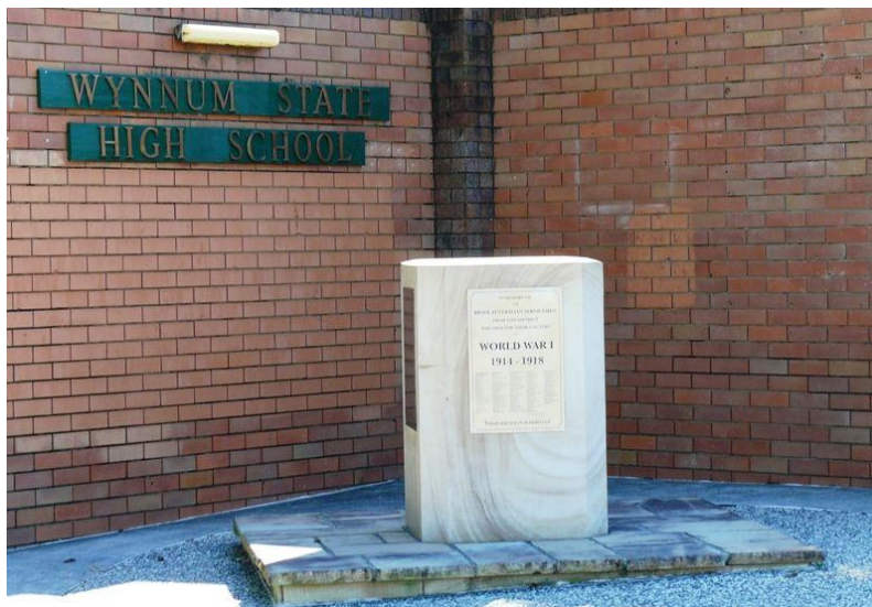
Wynnum High School War Memorial